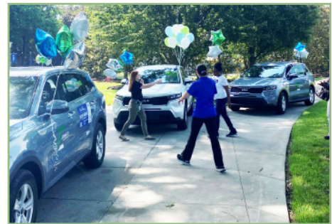
Transit: Supporting public transit in Abbeville & Greenwood counties and vanpooling across the Upstate