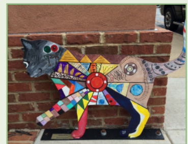
Seneca 3-Part Art