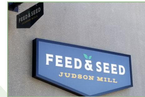
Feed & Seed Food Hub at Judson Mill

Though TATT is not a direct service organization, several efforts incubated through TATT's role as a convener and connector have led to major local and regional impacts across the region.