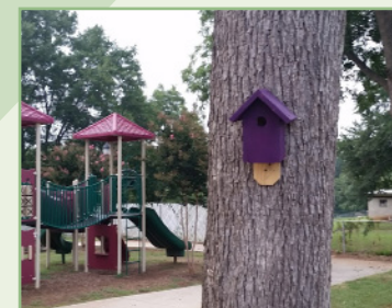
West Pelzer Bird Sanctuary