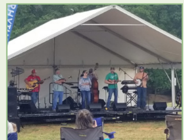
Rhythm on the River, Powdersville