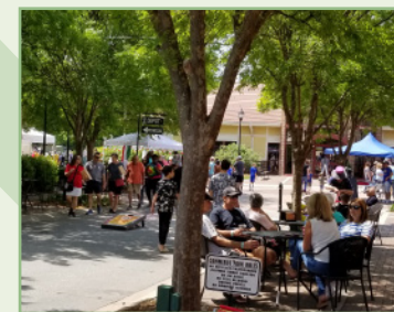
Upstate Italian Festival