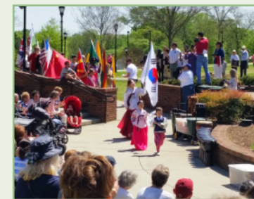
Greer International Festival