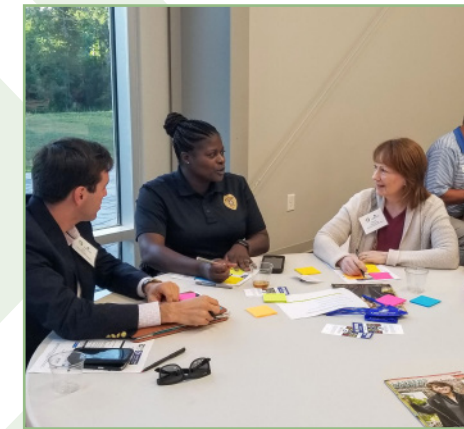
Vision session that launched successful county referendum to support public infrastructure in Laurens County