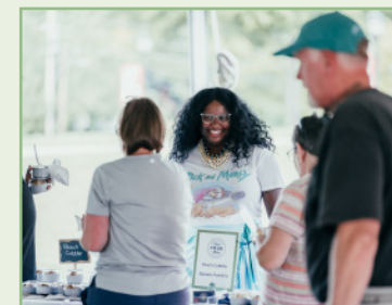
Blues, Brews & BBQ