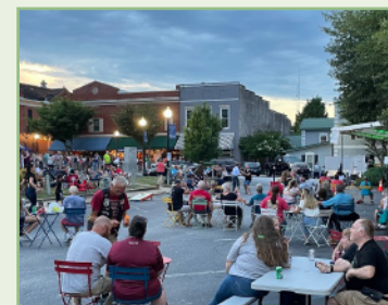
Finally Friday on the Square, City of Laurens