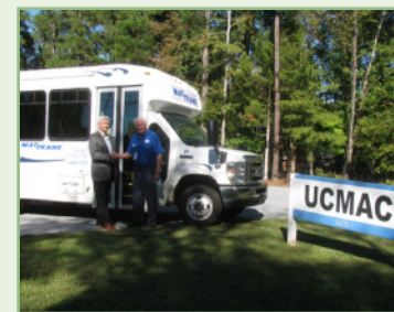
Abbeville Public Transit